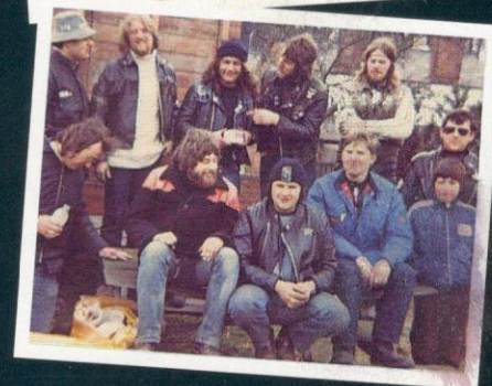
Capturing the past: photos from the club's illustrious past activities